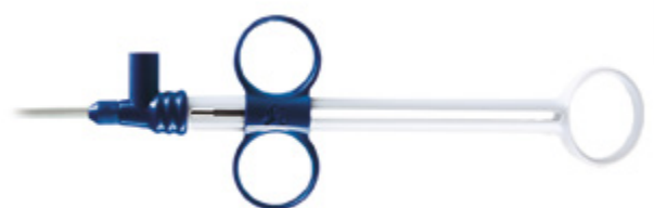
Precision grip with ergonomic design