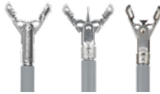
Jaw Ø 2.3 mm, 120 cm length