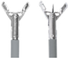
Jaw Ø 1.8 mm, 120 cm length