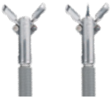
Jaw Ø 1.8 mm, 120 cm length