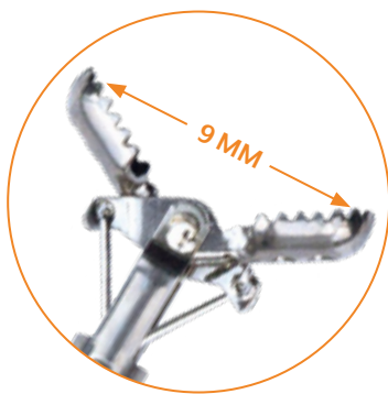
LARGE SPAN FOR LARGE TISSUE SAMPLES

Due to their particularly sharp cutting edge, the forceps allow precise removal of biopsates. The amount of effort in this case is minimal. The biopsates acquired biopsy samples are large and therefore provide sufficient tissue for diagnostically conclusive findings.