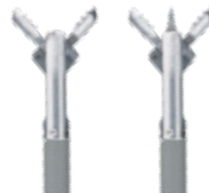
Jaw Ø 1.8 mm, 120 cm length