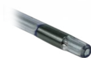
High quality bougie tip for precise insertion