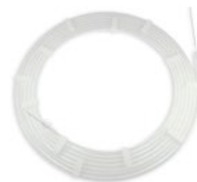
Dispenser guide wires

The wire can be easily ejected and retracted by means of this innovative dispenser. Owing to its compact design, the dispenser is handy and easy to operate. Rinsing the wire is also easy and fast when using the dispenser.