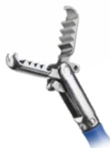
Type Griffin: long alligator jaw with 2:1 teeth