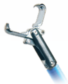
Type: 2-1 teeth