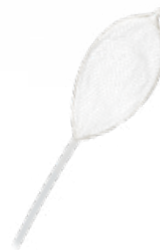
Shape stable MT net