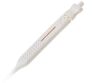
Ergonomical handle with defined breaking point