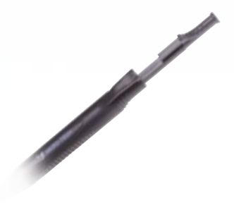
Compact ergonomical design