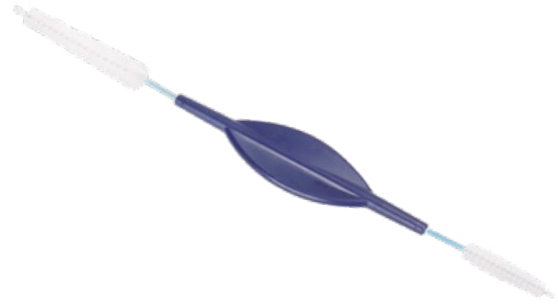
Double headed cleaning brush for air-water valve

MICRO-TECH offers the all inclusive solution for the thorough brushing of the air-water valve vents and ports. The double header brush combines a 40 mm long and 11 mm thick port brush with a 20 mm long and 5 mm thin vent brush. Both brushes are flexible and have protective distal beads to help prevent damage to the endoscope.