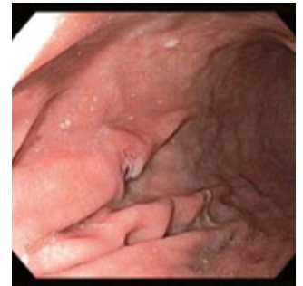
After biopsy removal